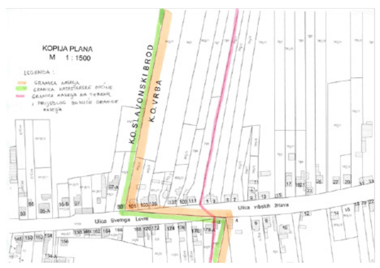
Fig 3. Street-naming draft of Svetog Lovre Street in the settlement Gornja Vrba. The Svetog Lovre Street is a part of the cadastral plot 1339 in the cadastral municipality Vrba running from the western border of the cadastral municipality Vrba to the house on the cadastral plot 795/1 in the cadastral municipality Vrba with the house number 1 in the Vrbskih Žrtava Street in the settlement Gornja Vrba)